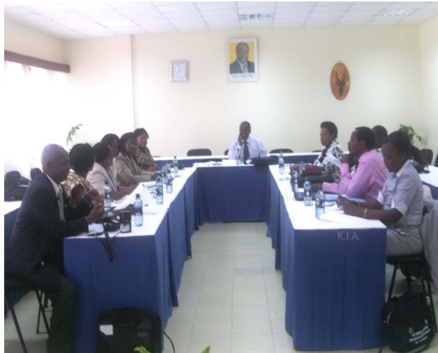
APS-HRMnet Executive Council in session at KIA Nairobi October 2009. In this session the Executive Council was joined by Members of its Advisory Technical Committee